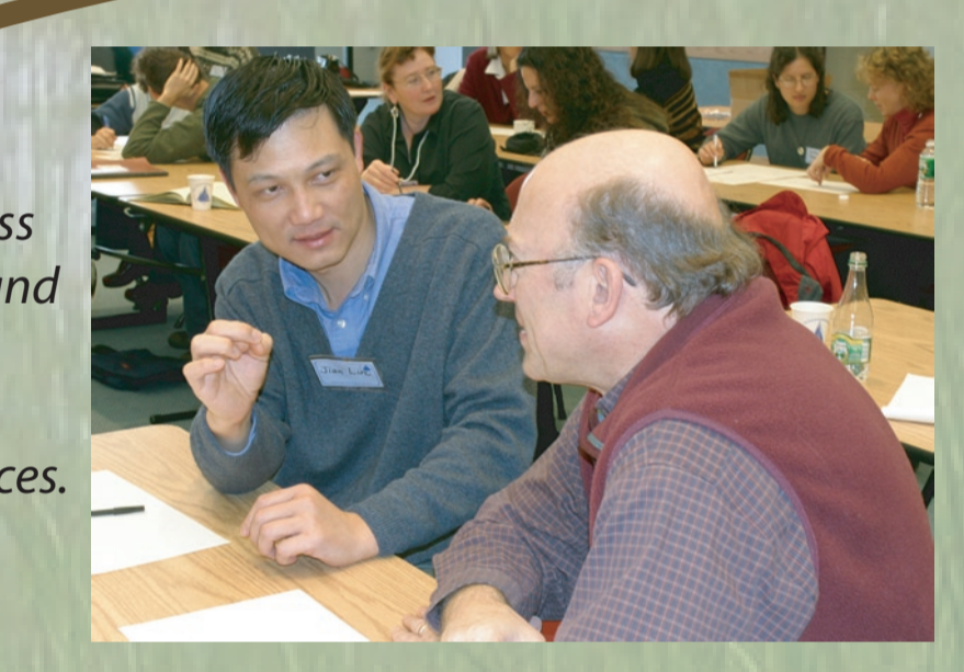
Scientists discuss their research and how best to tell their story to specific audiences.